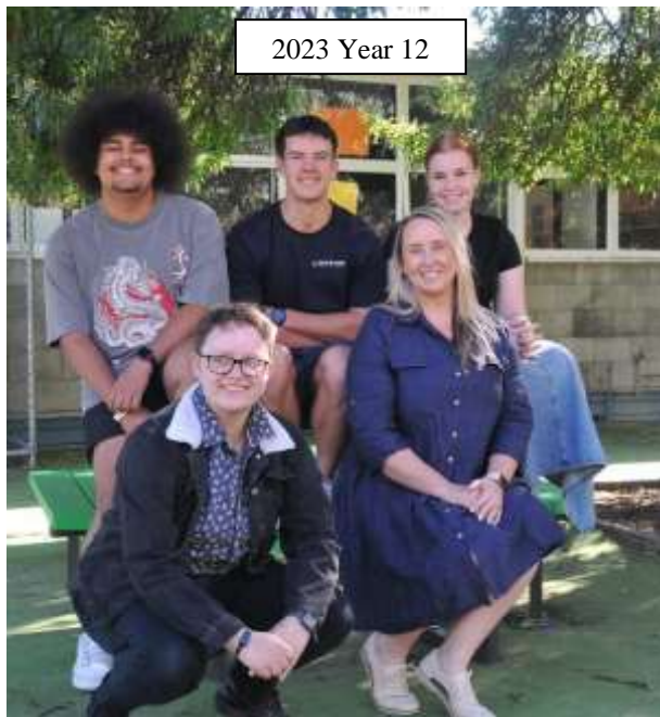
2023 Year 12

Well done to all of our bright and ambitious students!