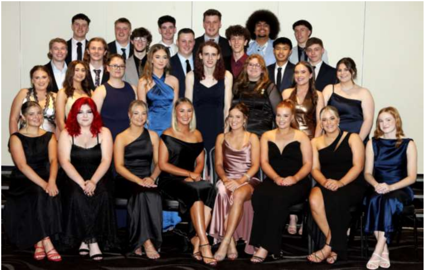
Photo: 2023 Graduating Students from Euroa Secondary College.