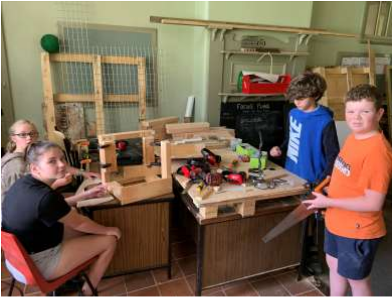
Students repaired a low table that is used in the music room at ESC

The program will continue next term with the same students when we hope to fix more things, continue improving the community garden, engage with Euroa Arboretum to help support their great community work, and more!