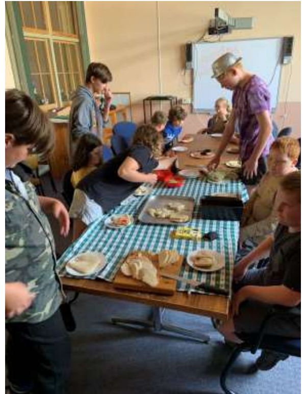
HoL team sharing a well earned lunch with their home-made bread.